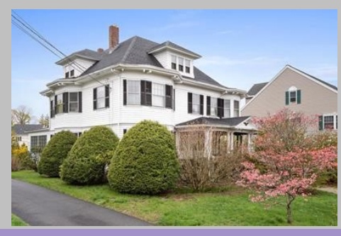
Incorporated in 1973, Beaverbrook STEP's mission and philosophy focus on empowering individuals to make their own personal choices and decisions about their lives to achieve full community inclusion.

Beaverbrook STEP will open a beautiful new home this September. This spacious residence with 1st floor accessibility is located in the lovely Lyman Estate area in Waltham. It will be the future home of 5 young women who are part of the advancing real lives movement and eager for community living. All the women will be supported by our skillful team of clinical specialists.