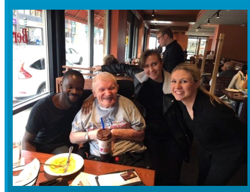
Friends sharing a meal at a local eatery.